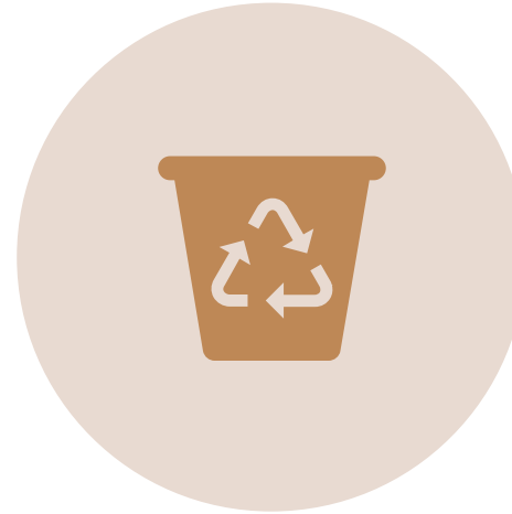
EMPTY PLASTIC BOTTLES