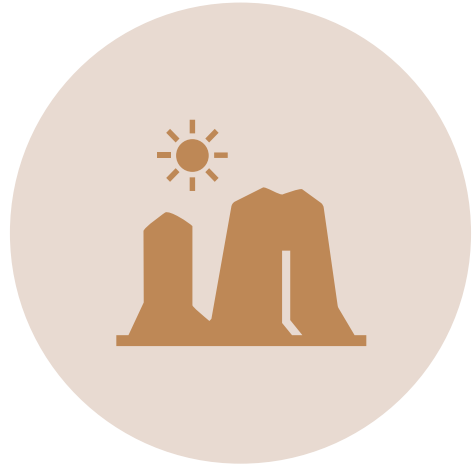
POTS & ROCKS